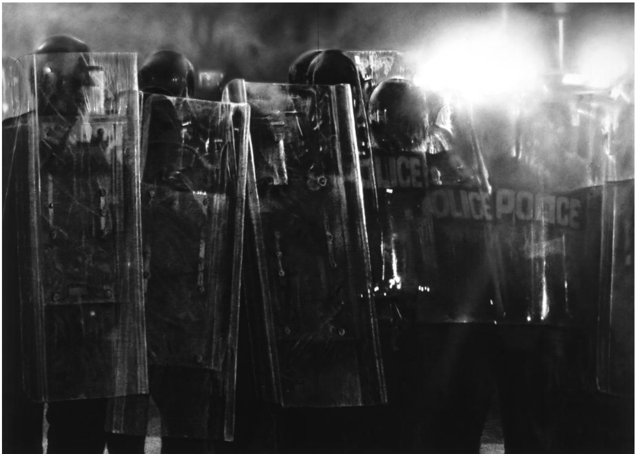
Robert Longo, Untitled (Riot Cops) , 2016. Charcoal on mounted paper, two panels, 101 x 140 inches (256.5 x 355.6)