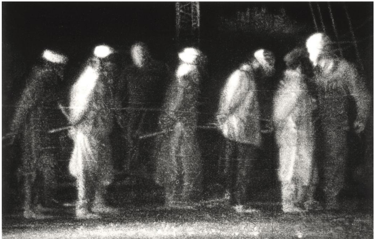
Robert Longo, Untitled (Prisoners, Kandahar Airport) , 2016. Charcoal on mounted paper, 92 x 143 inches (233.7 x 363.2 cm).