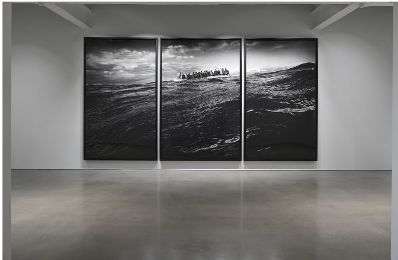
Robert Longo, Untitled (Raft at Sea) , 2016. Charcoal on mounted paper, 140 x 281 inches (355.6 x 713.7 cm) overall. Courtesy of the artist and Metro Pictures, New York

There's a work in this show called Untitled (Raft at Sea) (2016–17). I saw a photo of refugees on a raft in the Mediterranean. It was in a brochure for Doctors Without Borders, an organization with which I work. I contacted the photographer, Will Rose, and purchased the image from him, and I combined it with a photo I took at my beach house on Long Island, adding ten feet of water to the original image to make the audience feel as if they were in the water too.