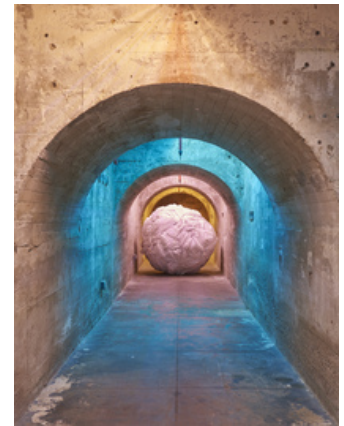
SculptureCenter New York, United States