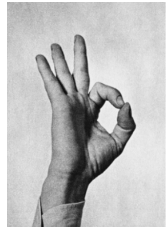
Kunsthalle Wien Vienna, Austria