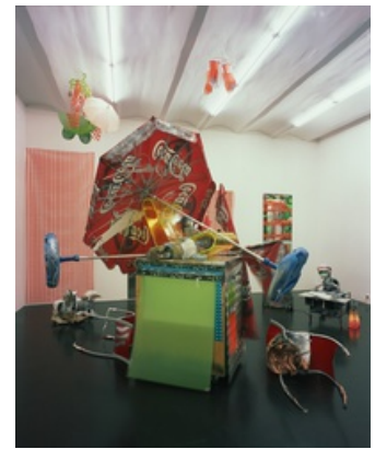
Galerie Buchholz Cologne, Germany