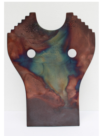
Sultana Paris, France

Contemporary Art Venues Sponsored Listings