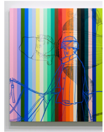
Upfor Portland, United States