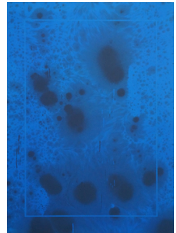
Ghebaly Gallery Los Angeles, United States