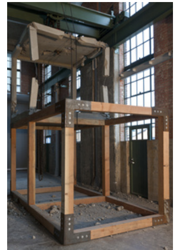
The Power Station Dallas, United States