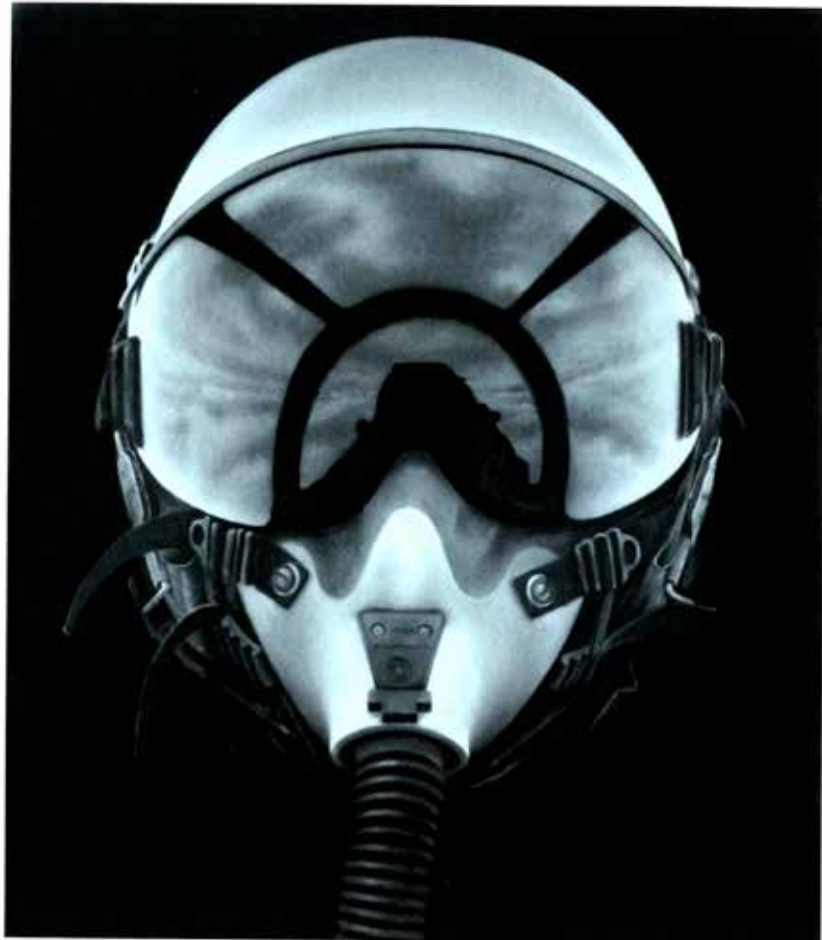
ROBERT LONGO UNTITLED (EDOUARD), 11.1.2011 CHARCOAL ON MOUNTED PAPER, 40 x 70 INCHES