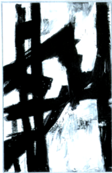
ROBERT LONGO UNTITLED (AFTER KLINE), NEW YORK, NY, 1953, 2014 CHARCOAL ON MOUNTED PAPER, 109 x 140 INCHES

The irony is that, in hindsight, Magellan has become my image lexicon, the vocabulary for my subsequent work. It's astonishing to realize that our world has not changed much since. If you look at the series, you can find almost all the subject matter I've investigated since Magellan . At the same time, the images I was finding in 1996 also remind me of the ones I saw when I grew up. I realized how much all those pictures had an impact on me. There are archetypal images now, which are surrogates for ancient archetypes.