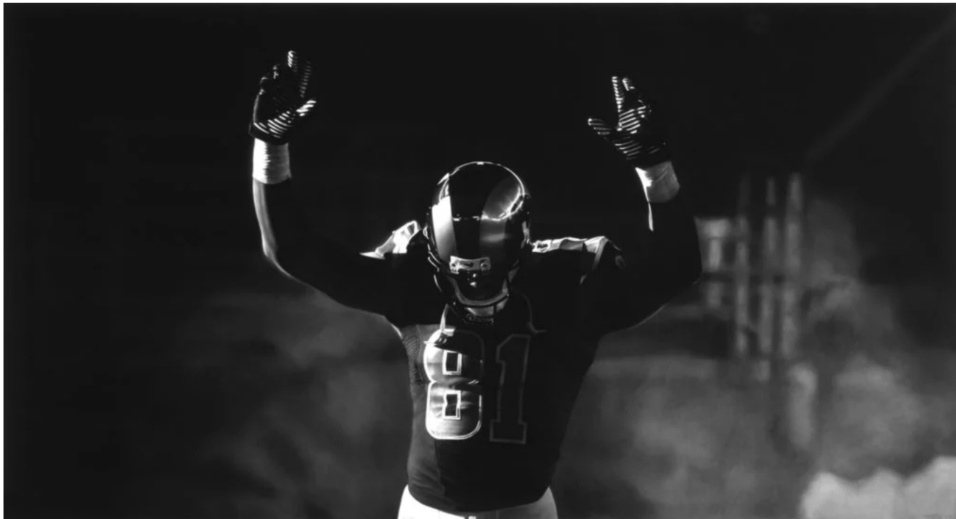
Robert Longo, Untitled (St. Louis Rams/Hands Up) (2015). charcoal mounted on paper, 65 x 120 inches© Robert Longo, Collection of the artist.

Terence Trouillot ( https://news.artnet.com/about/terence-trouillot-602 ), September 22, 2017