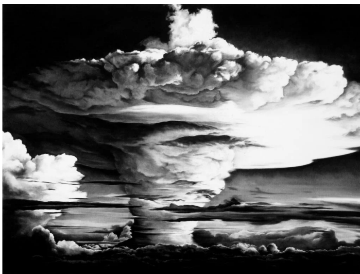
Robert Longo, Untitled (Mike Test/Head of Goya) (2003). Charcoal on mounted paper, 72 x 96 inches.

It was really funny too, because I lived with them through their elections—a few of the younger folks voted, but their parents didn't because they don't have voting in their history. "What's voting? And who am I going to vote for when there is only one political party?"