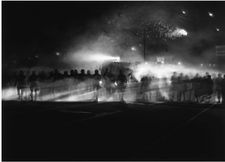
Robert Longo, Untitled (Ferguson Police, August 13, 2014) (2014). Charcoal on mounted paper, 86 x 120 inches. © Robert Longo, The Broad Art Foundation.

Correct me if I'm wrong, but wouldn't you regard yourself as a political artist? I know you were talking about this difference between political art and making art that's responding to the times. But in some sense there has been a shift in your more recent work. And by that I mean, your piece on Ferguson, the drawing of the refugees on the raft... I mean these are very political works.