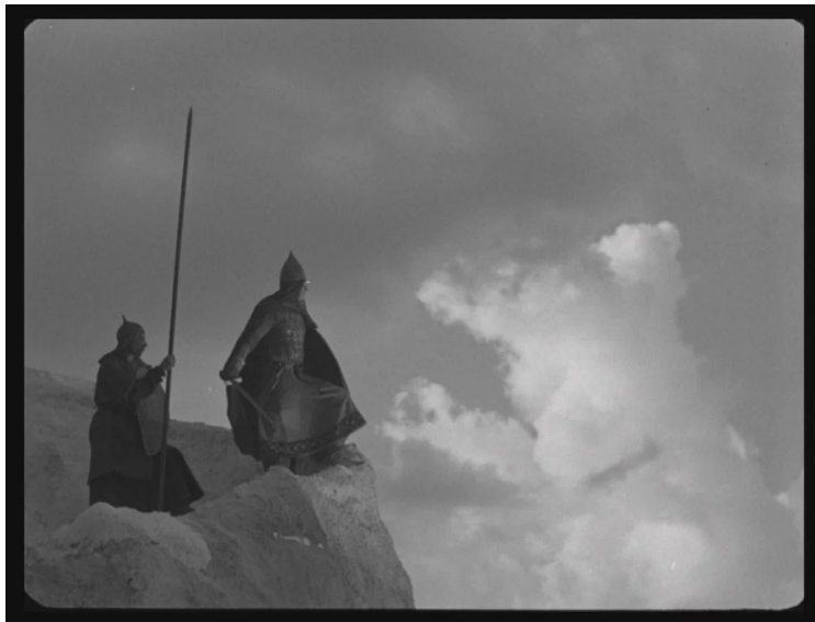
Sergei Eisenstein, still from Alexander Nevsky (1938).

So in some sense it's similar to your practice. Not only are you taking these films—I wouldn't say appropriating them, but you're manipulating them and making them your own in some way.