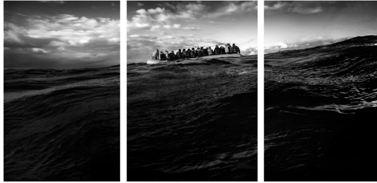
Robert Longo, Untitled (Raft at Sea) (2016–2017). Charcoal on mounted paper, 140 x 281 inches. © Robert Longo, Private European Collection.

Recently, we met with the artist at the Brooklyn Museum to discuss “Proof,” his fascination with Goya and Eisenstein, and how his work has changed over the years.