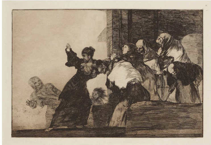
Francisco de Goya, Two heads are better than one , from the series "The Follies (Los Disparates)", (1819-24).

However, the Brooklyn Museum has some of the most extraordinary prints by Goya already in its collection. They are all artist's proofs and so slightly different than the final version. It blows my mind because it means that Goya actually saw these prints himself.