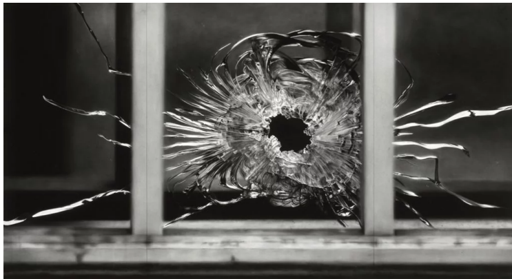
Robert Longo, Untitled (Bullet Hole in Window, January 7, 2015) (2015–16). Charcoal on mounted paper, 76 x 143 inches. © Robert Longo, Ståhl Collection Norrköping, Sweden.

I remember saying, "What does that mean? Do we go back to slavery? What are traditional American values?" And the thought that someone could tell me that I can't do what I do, was at the front of my mind. Freedom of expression became really important. That's why the bullet hole piece [ Untitled (Bullet Hole in Window, January 7, 2015) ] becomes really important to me.